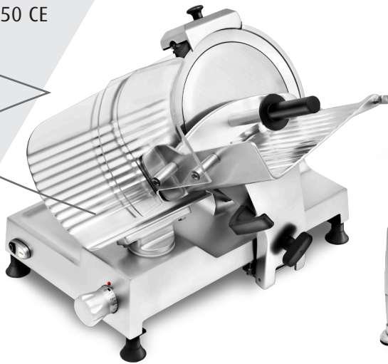
START 300/350 CE